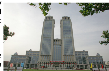
Fudan University in Shanghai

To be held at Fudan University in Shanghai 19-20 September 2011. The best papers will be published in a special Symposium of the China Economic Review . A call for papers will be sent to the ACESA mailing list soon.