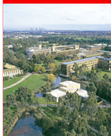
La Trobe University

Hosted by University of Western Australia on the 7-8th July 2011. The organiser invites all papers addressing topics such as economic reforms and growth, international trade, agricultural economy, resource sector and sustainable development, macroeconomics and microeconomics and China and the world economy. In addition, conference participants are most welcome to organise special sessions at the conference. Abstracts of papers are due on February 25, 2011. Please see the ACESA website for further details, http://www.acesa.ecel.uwa.edu.au .